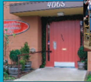
CEDAR COTTAGE NEIGHBOURHOOD HOUSE