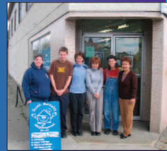
SOUTH BURNABY NEIGHBOURHOOD HOUSE