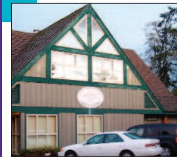
CRESCENT BEACH COMMUNITY SERVICES